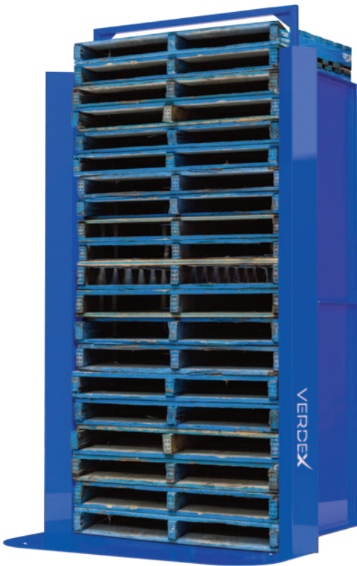
V1496 pictured with Pallets