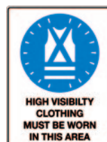
400x600mm Code: V126LM