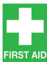
225x300mm Code: V501MM