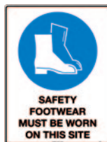
400x600mm Code: V129LM