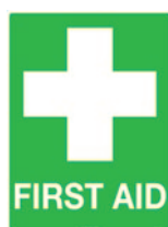
225x300mm Code: V501MM