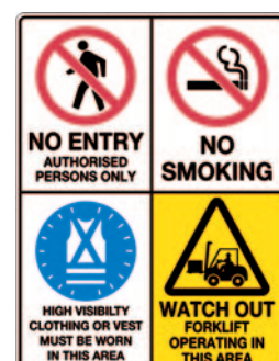
400x600mm Code: V387LM