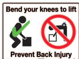
600x400mm Code: V419LM