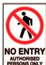
300x450mm Code: V401LSM