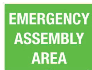
600x400mm Code: V509LM