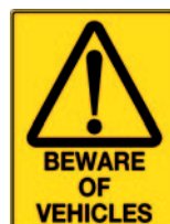
400x600mm Code: V309LM