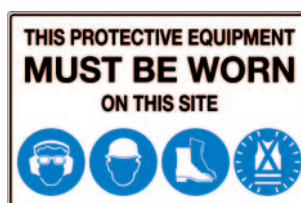
400x600mm Code: V100ELM-S1