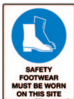
400x600mm Code: V129LM