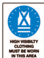
400x600mm Code: V126LM