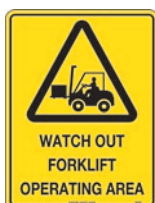
400x600mm Code: V395LM