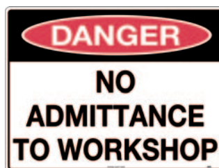
600x400mm Code: V250LM