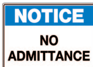
600x400mm Code: V147LM