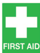
225x300mm Code: M501MM