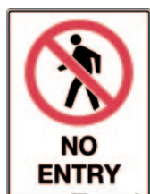
300x450mm Code: V469LSM