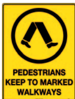
400x600mm Code: V355LM