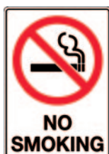
300x450mm Code: V402LSM