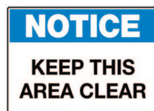
600x400mm Code: V183LM