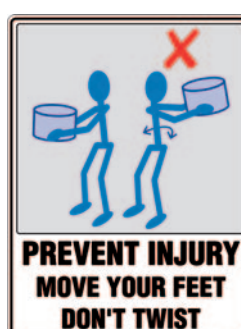
400x600mm – POLY Code: V653LP