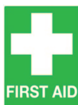
225x300mm Code: V501MM