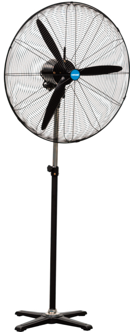
Height fully extended