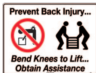
600x400mm Code: V457LM