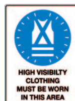
400x600mm Code: V126LM