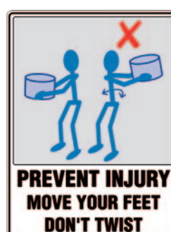
400x600mm – POLY Code: V653LP