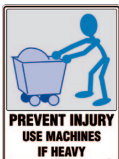
400x600mm – POLY Code: V655LP