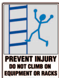
400x600mm – POLY Code: V654LP