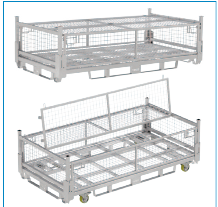
Pictured with V7543 & V7542