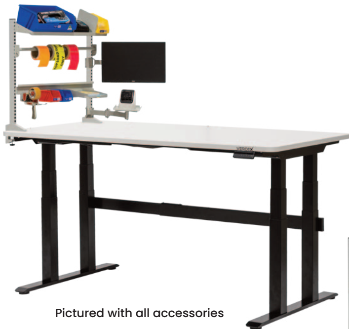
Pictured with all accessories